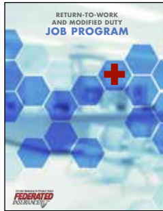
Return-to-Work and Modified Duty Program