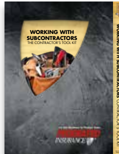
Contractor's Tool Kit—Working with Subcontractors