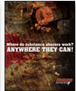
Drug- and Alcohol-Free Workplace Program

Yes! I would like to receive complimentary risk management materials from Federated Insurance.