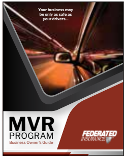
Motor Vehicle Records